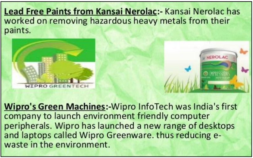
Examples of Green Marketing

Alsmadi (2007) this study was conducted in the Jordan region and the researcher established that the customers are highly worried about the safety of the environment and willing to do whatever required. This attitude of the customer is also visible in the final purchase of the products where they are willing to pay the extra price for the safety of their environment.